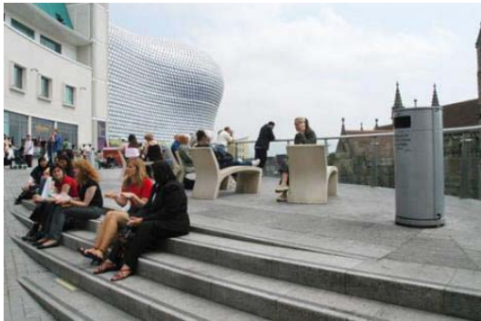
Use of steps to create useable terraces and informal seating