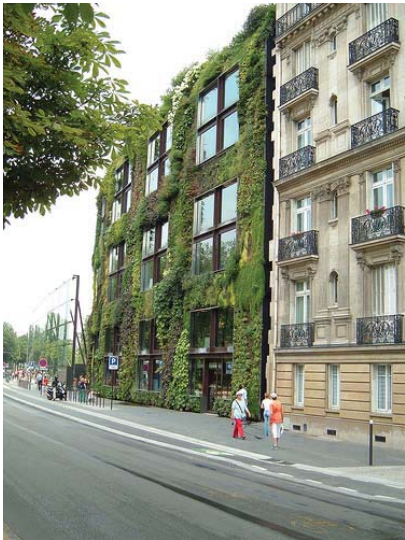
Potential for 'green wall' to blank facade of former Debenhams fronting new space